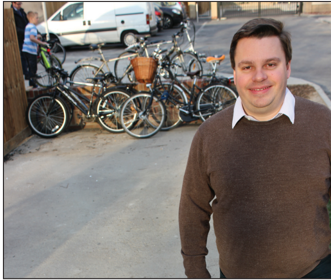
Cycle parking: it's the city council's turn to do its bit at the new pub site.

The new Queen Edith pub on Wulfstan Way has its own cycle rack and plans to install more cycle parking soon. They also paid substantial cash to the council as part of a so-called 'section 106' settlement. It was expected that the city council would provide further cycle parking next to the recycling bins but there seems to have been no progress. It would be helpful if the councillor elected on 7 May could get to grips with this.