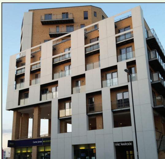
The Marque, Hills Road.

The much needed housing for Cambridge needs to come from well designed new settlements like Northstowe not the piece-meal addition of flats for London commuters.